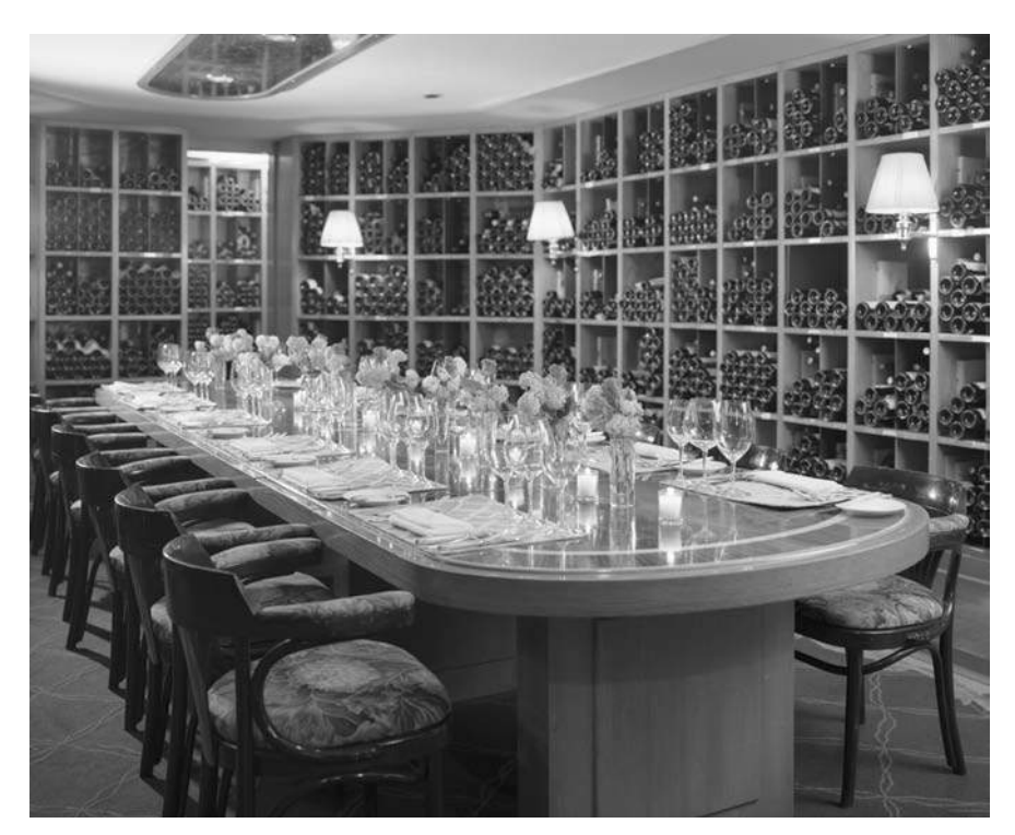
A private dining room at the 21 Club where guests may enjoy selections from the extensive wine list