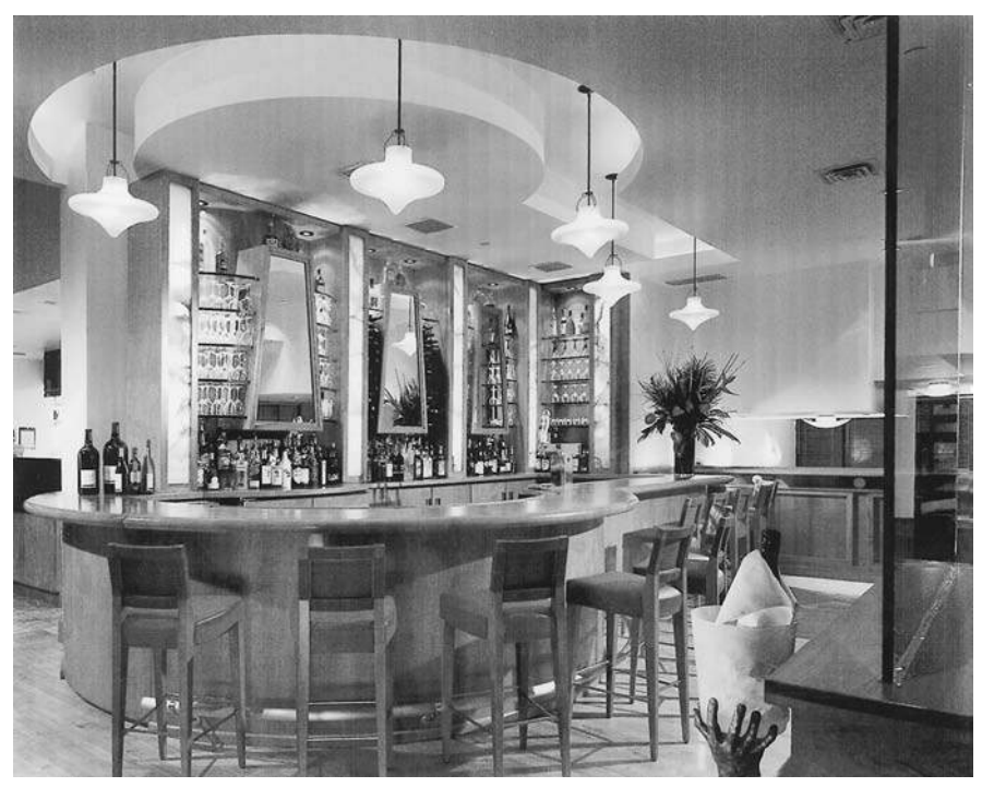
The bar at Roy's New York City welcomes guests to a restaurant with a multiaward-winning wine list to match the Hawaiian-inspired Euro-Asian cuisine