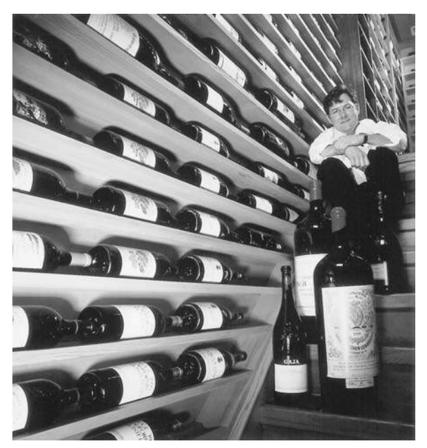
Charlie Trotter's offers an incredible selection of wine, including some 30 by the glass, to complement the dining experience

The combination of great food and wine is one of life's greatest pleasures. Today, anything goes, meaning that if a guest wants a red wine with a white meat, that's