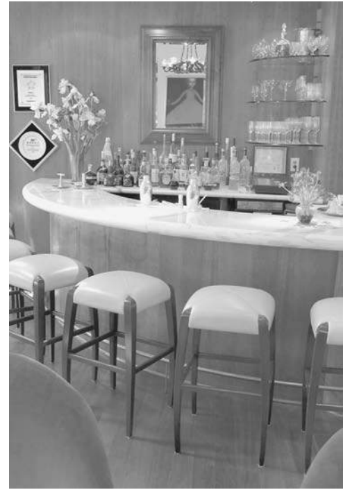
The bar at Seeger's Restaurant

The more popular varietal white wines are champagne and sparkling wine. Unless you have a large restaurant, you should select one of each. To save